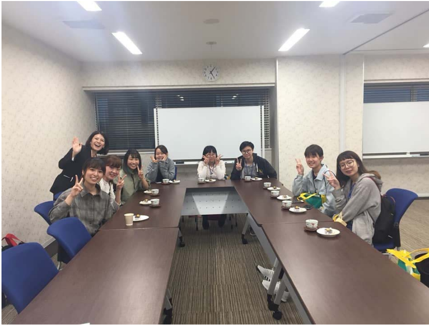
Apart from acquiring new technology and knowledge, students from both universities were encouraged to have an open talk at tea time