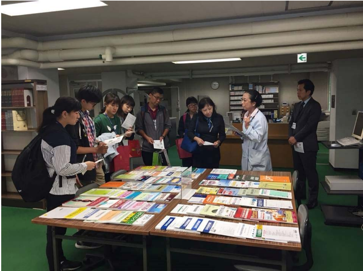
Visiting library where a numerous number of research and materials were stored.